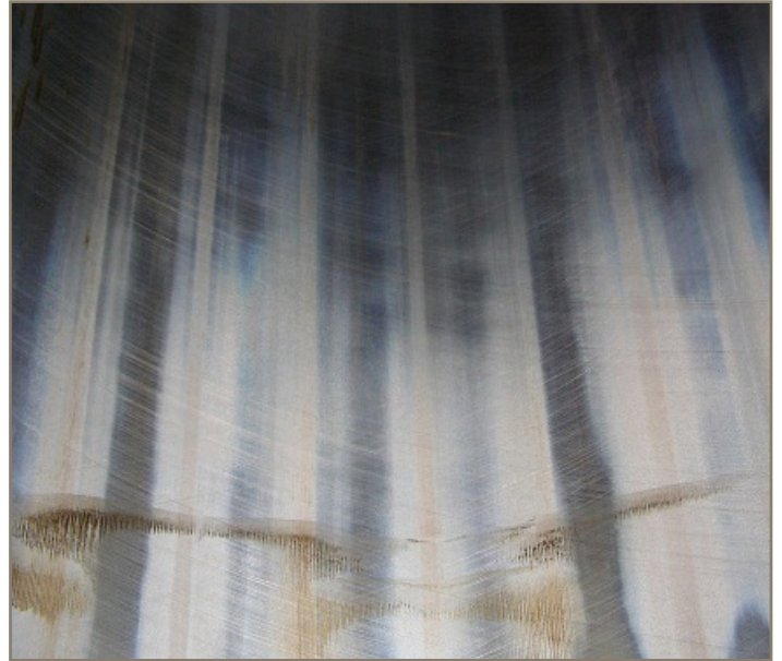
Cold Corrosion on liner surface

Parker Kittiwake's patent pending new Cold Corrosion Test Kit is a quick, simple to use chemical test that provides an accurate measure of the parts per million (PPM) value of Fe^{2+} and Fe^{3+} compounds in used scrape down oil. Rather than simply giving a figure for the total iron (including metallic compounds), which other tests provide, knowing the specific PPM of corroded iron allows informed decisions to be made in adjustments to feed rates and the Base Number (BN) of the oil used. The quick test (<5 minutes per cylinder) allow rapid analysis of the whole engine. No long waiting periods are required to obtain accurate measurements. Coupled with tests to measure the metallic content (such as Parker Kittiwake's LinerSCAN or Analex Alert), the cause of high levels of iron can accurately be determined. High Iron levels caused by scuffing incidents or Catalytic Fines in bunker fuels can be isolated from cold corrosion issues. Conversely, corrosion caused by sulphuric acid corrosion of the liners can be isolated from other wear mechanisms in the cylinder chamber.