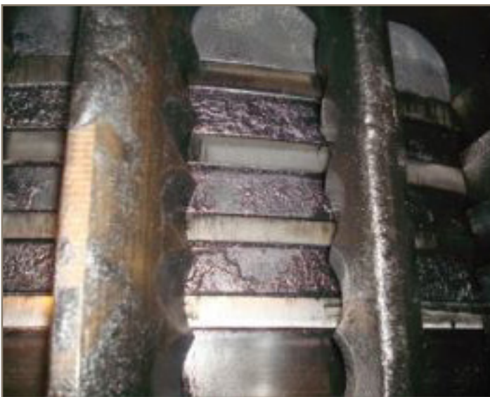
Deposit build up on piston due to over lubrication (too high feedrate)

One way of mitigating the effects of cold corrosion is to increase the scrape down oil feed rate. Not only does this increase the use and therefore cost of the oil used, over lubricating can have a detrimental effect due to fouling of the rings and calcium deposit build up. Knowing the exact operating conditions and wear mechanisms within the cylinders allows fine adjustment of the feed rates to minimise wear and reduce costs. Engine Original Equipment Manufacturer's (OEM's) have recently issued service letters giving guidance as to acceptable levels of corrosive wear.